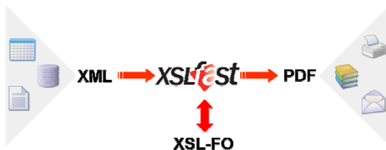
Fig. Layout creation for XML data with XSLfast. The data are available as XSL-FO file for an automated process to produce a printable PDF.

Today, many XSL:FO layout templates are still created manually by means of text editors. With XSLfast, jCatalog Software AG has developed a software product that aims at substantially simplifying the process of creating layouts by allowing you to design layout templates - so-called style sheets - via an intuitive graphic interface. This method leads to the creation of visually attractive layouts in no time with only little effort.